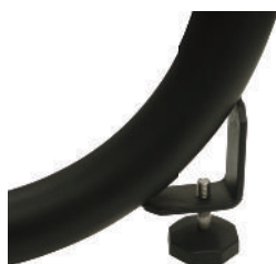
Additional pole-support foot