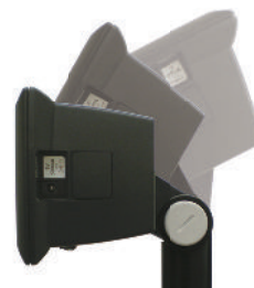
Tilting indicator bracket